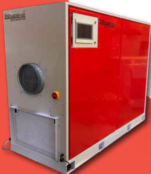
80°F 60% - Example Settings

Over thirty-seven years of development experience means you can rely on the proven track record of the EIP range of dehumidifiers. Every dehumidifier is designed for efficiency and ruggedness, and built to last. The popularity of EIP Ltd's dehumidifiers with the plant hire trade speaks for their reliability, portability and outstanding durability.